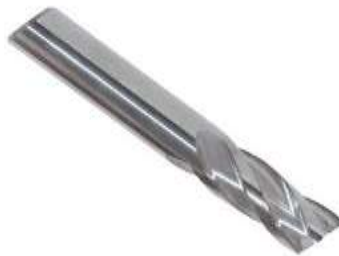
Fig. 1 Flat end mill

Milling experiments were performed on an HAAS CNC milling machine and flat end mill used was made of HSS and have a diameter of 6 mm as shown in Fig. 1.