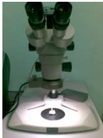
Fig. 3 Tool maker microscope

Delamination as shown in Fig. 2, is measured using a tool maker microscope (Fig.3).